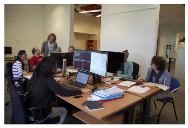
JIVE support scientists at work

See the <u>EVN Travel support</u> pages or contact campbell@jive.eu for further information.